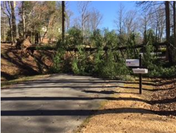
Excitement on Black Oak Drive

Bob Hanny texted me the picture above to let me know about the sad collapse of the lovely pine across Black Oak Drive on 3/23/17. They were very pleased that VDOT responded within 20 minutes!